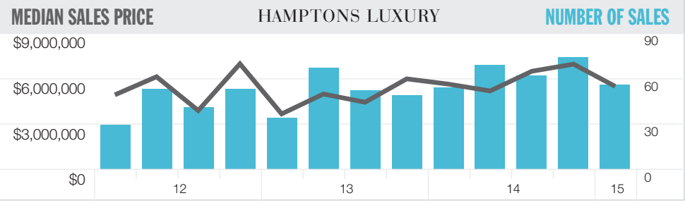
©2015 Douglas Elliman and Miller Samuel Inc. All worldwide rights reserved.

Note: This sub-category is the analysis of the top ten percent of all sales. The data is also contained within the other markets presented.